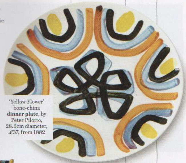
'Yellow Flower' bone-china dinner plate, by Peter Pilotto, 28.5cm diameter, £37, from 1882