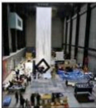
Attractions: Tate Modern's Turbine Hall